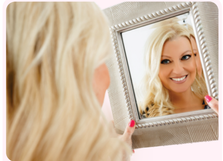
Chose to be a Role Model - Instead of a model