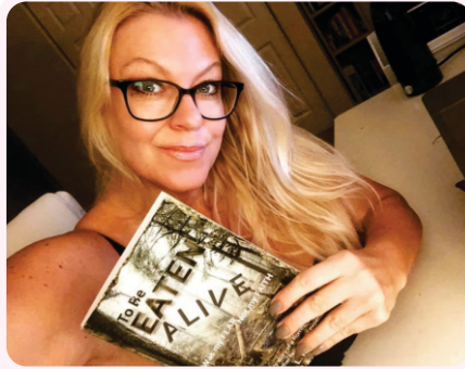
Helped my dad publish his first book at the age of 80