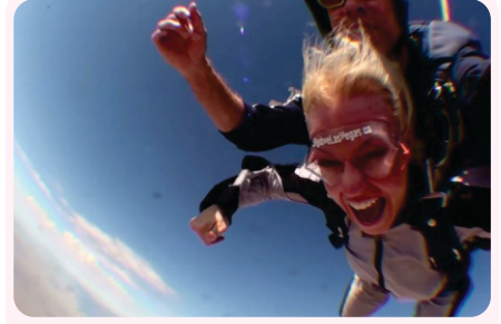
Enjoys Sky Diving and other adrenaline junkie activities