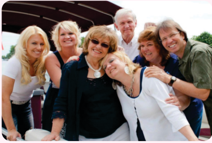
One of 5 Kids