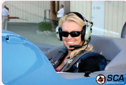
Flew a stunt plane – twice!