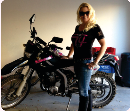
Owned a Dirt Bike